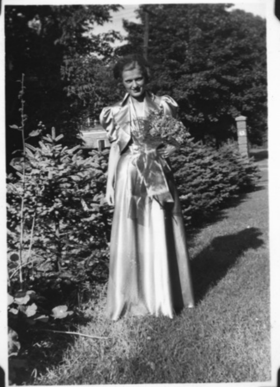
"Cleveland Fair 1937"