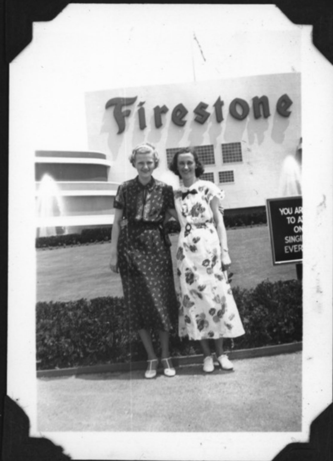
"Cleveland Fair 1937"