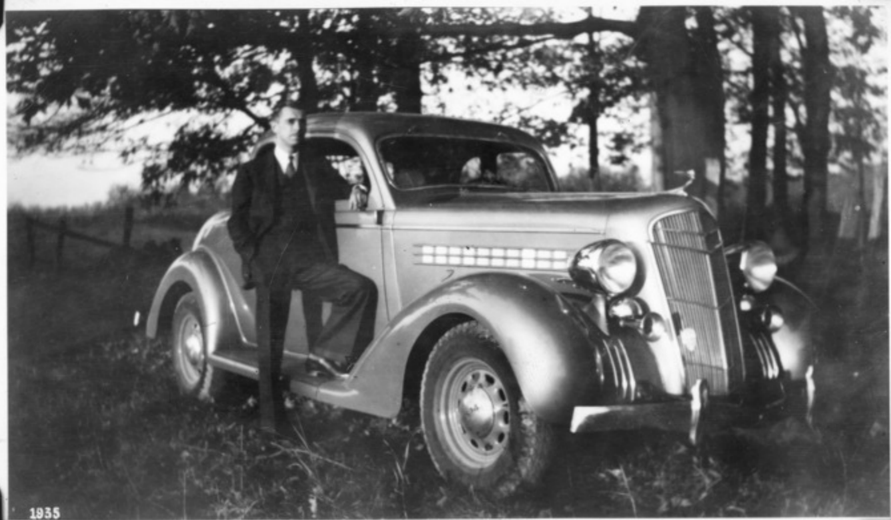
1935 DeSoto Deluxe Coupe